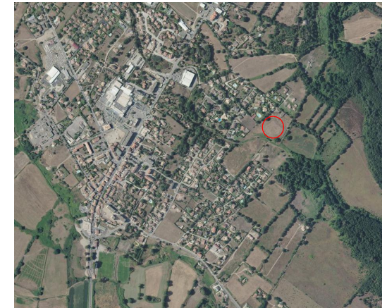
Plan de situation